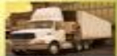
Transport & Distribution